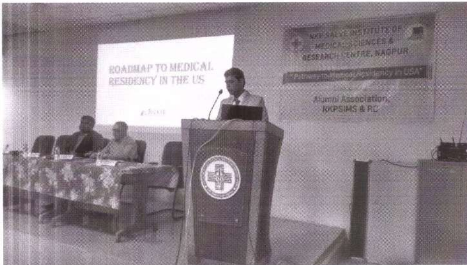
Secretary, Alumni Association NKPSIMS & RC & LMH

Alumni association has tied up with Alma shines group which has built software to streamline the alumni management in order to build robust and ever growing alumni community. The platform has been built in the form of a Web Application as well as Mobile Applications on iOS and Android. It has various modules, which will be helpful for making our association well connected.