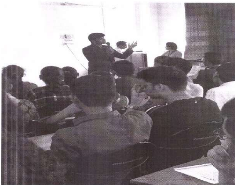
Secretary, Alumni Association NKPSIMS & RC & LMH