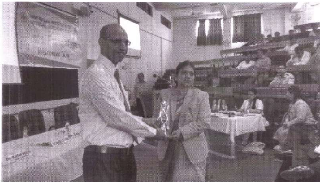
Secretary, Alumni Association NKPSIMS & RC & LMH