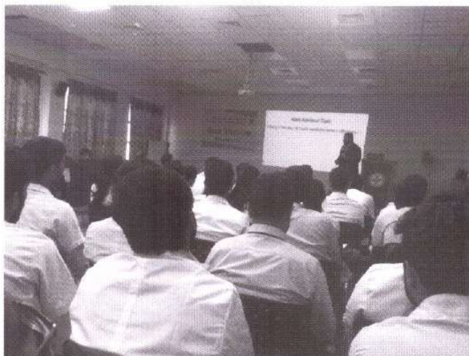
Secretary, Alumni Association NKPSIMS & RC & LMH