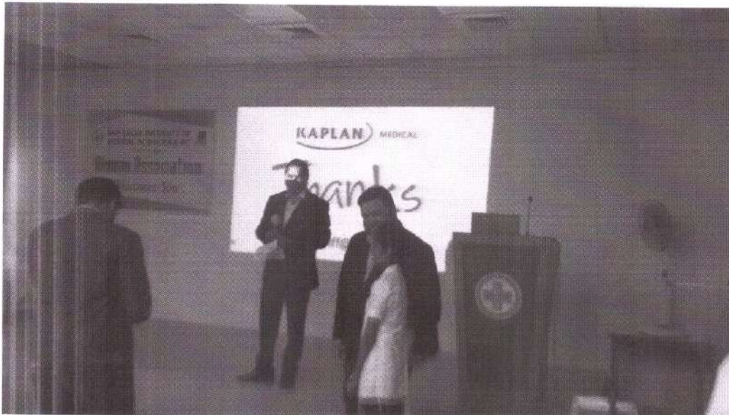
Secretary, Alumni Association NKPSIMS & RC & LMH

Phone (07104) 665000,244291, Fax:(07104) 306111- mail: nkpsims1@rediffmail.com /website: www.nkpsims.in